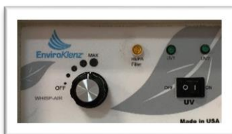
System On/UV lights Switched Off