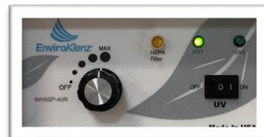
System On/1 UV light bulb burned out