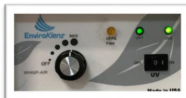
System On/UV lights Switched On