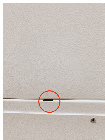
Safety Switch Not Activated when Panel is in Place